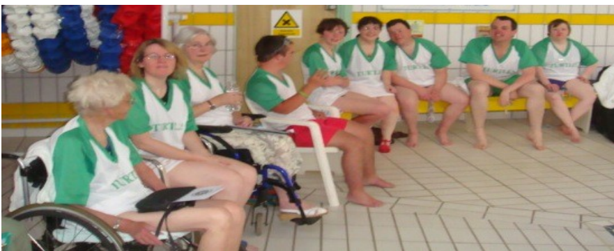
Every Turtles competitor won a medal at Hatfield—well done to the team!