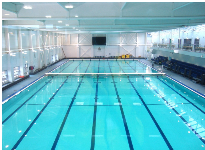
The new 50 metres pool divides into 2 separate 25 metres pools when required.

We remain in discussion with Hillingdon Sports Council regarding a possible additional Sunday evening session for the disabled at the new pool but nothing as yet has been agreed. It is likely that Highgrove will close at some point for refurbishment but we understand that no date has been agreed and the project is still being scoped, so nothing is likely to happen before the Summer and we will let you know the contingency arrangements when we know them.