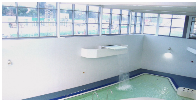
The new hydro pool facilities