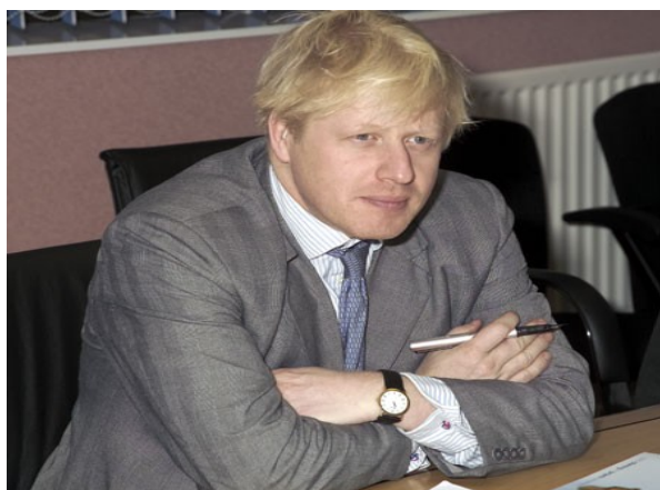
Mayor of London Boris Johnson will officially open the new leisure centre