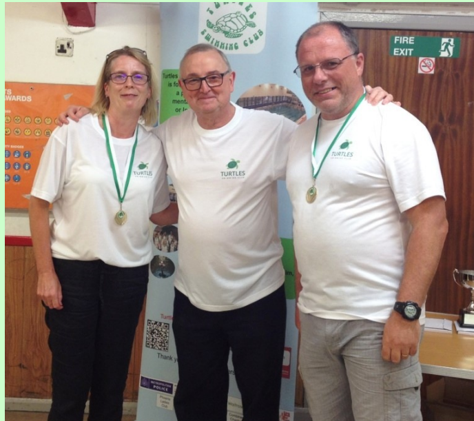
AGM June 2019